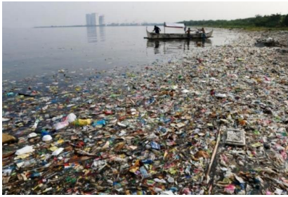
Fig. 2: A Photograph showing a seaside filled with tons of toxic wastes. Google