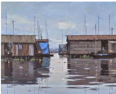
Fig. 4: A Painting reflecting a phase of slum dwellers.