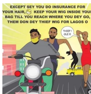
Fig. 1: An Illustrated composition conveying the robbers on bike Hunting after expensive wigs in Lagos. Artist: Ugo Jesse