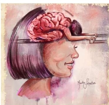
The unheard screech hidden behind the smile.. #helpfightdepression #speakup